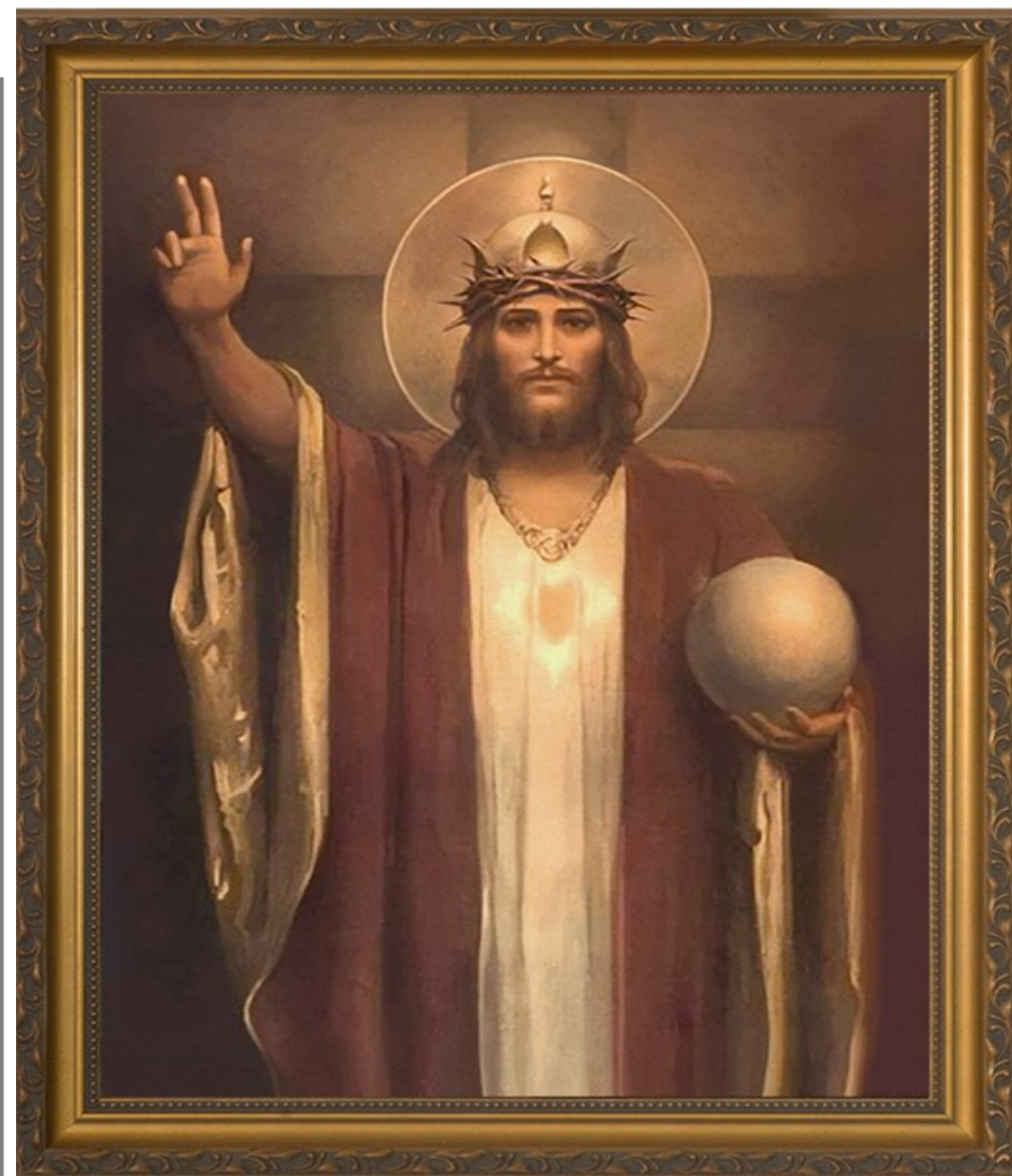
King of the Universe/Christ the King: Nov. 26

On the last Sunday of the liturgical year, we celebrate the Solemnity of Christ the King. Instituted by Pope Pius X in 1925, this solemnity reminds us of the never-ending reign of Christ as king of the Church and entire universe. Just as Jesus is both fully God and fully man, this week's gospel presents Jesus as both a shepherd and a king, showing us his grace as a leader who rules while nurturing and protecting his flock at the same time. On this same note, men are separated like sheep and goats — those who follow Christ's example will inherit eternal life, while the goats that turn a blind eye to the suffering of others will face eternal punishment. With the upcoming holiday season, take this opportunity to commit yourself to serving others as Christ teaches.